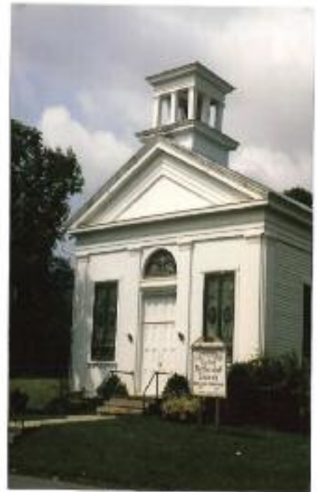
The Fultonham United Methodist Church