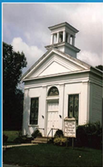
The Fultonham United Methodist Church